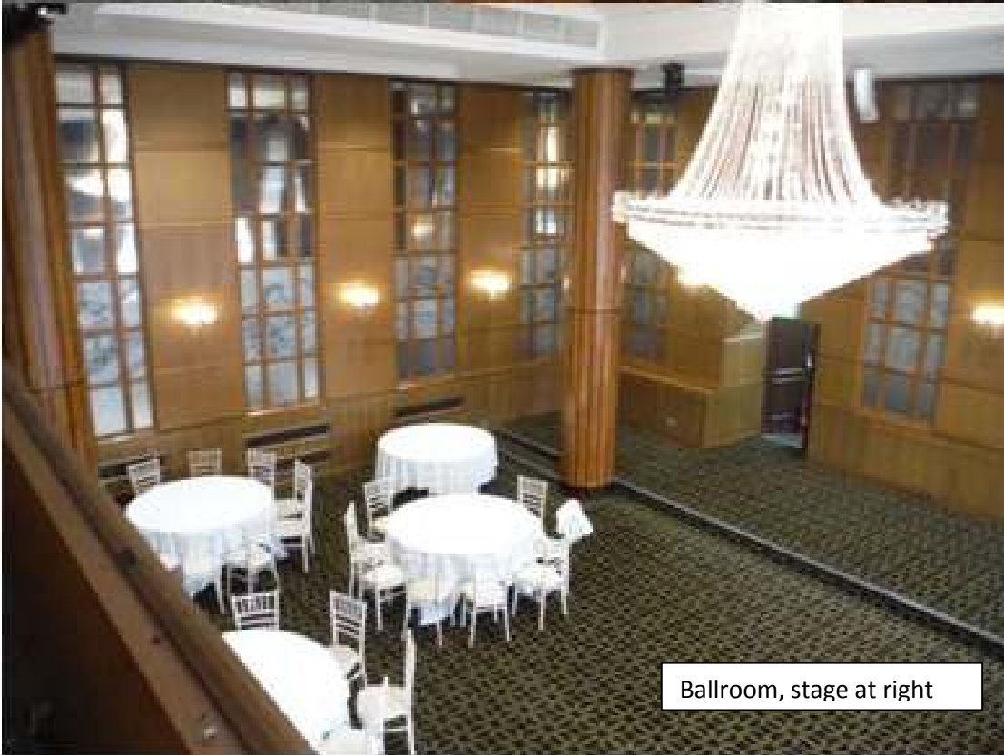
Ballroom, stage at right