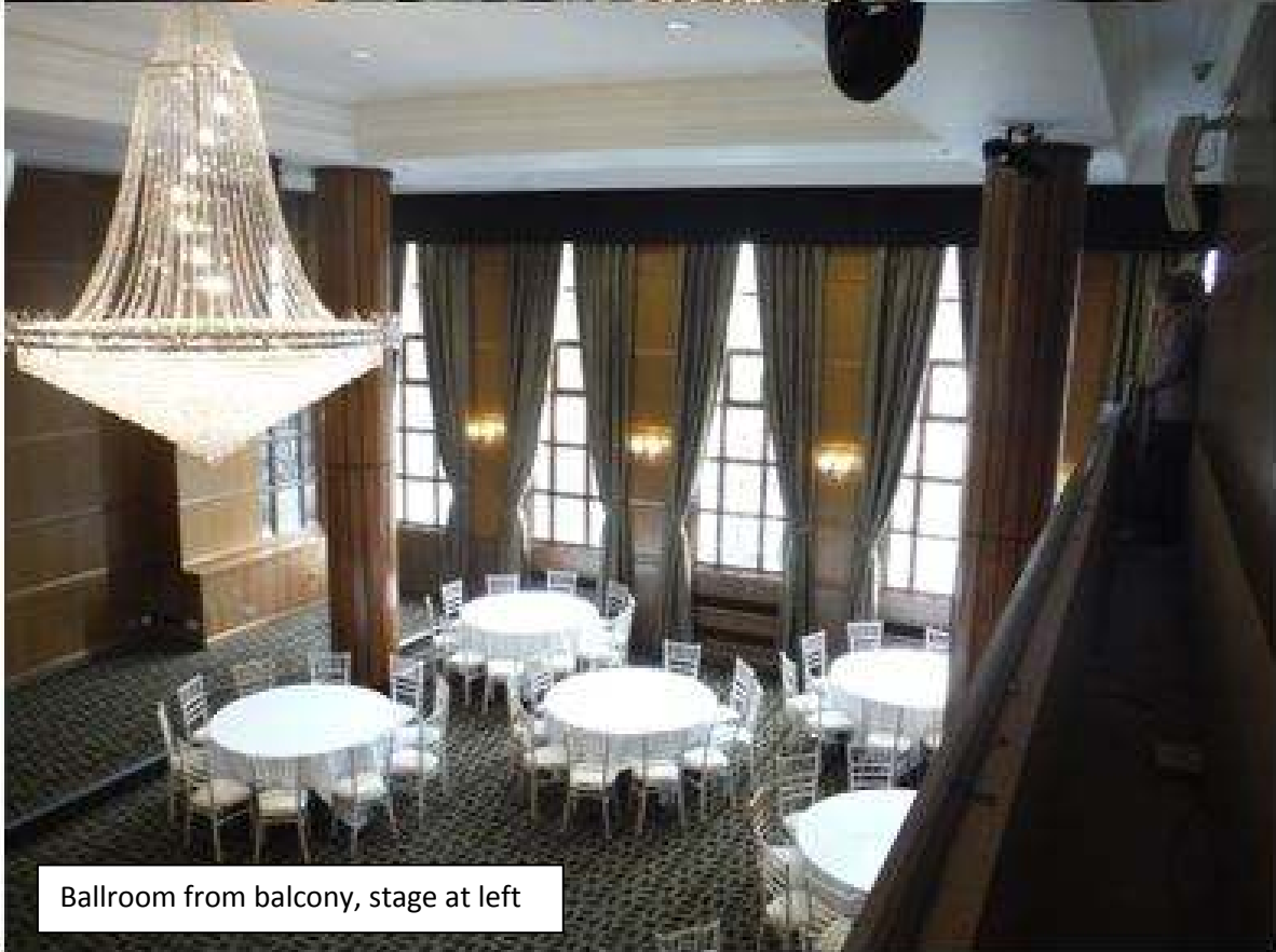
Ballroom from balcony, stage at left