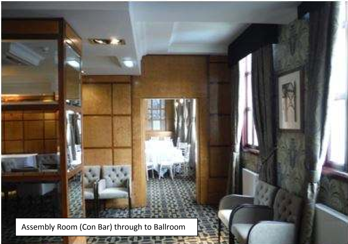
Assembly Room (Con Bar) through to Ballroom